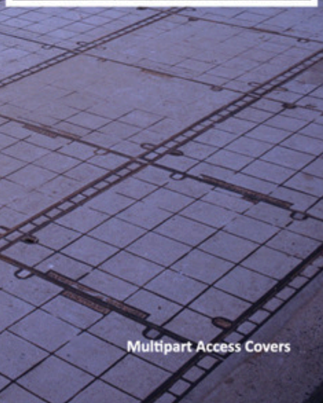
Multipart Access Covers