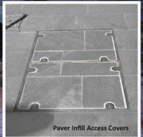
Paver Infill Access Covers