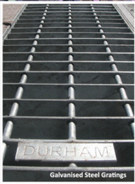
Galvanised Steel Gratings