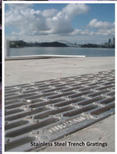
Stainless Steel Trench Gratings