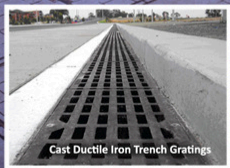
Cast Ductile Iron Trench Gratings