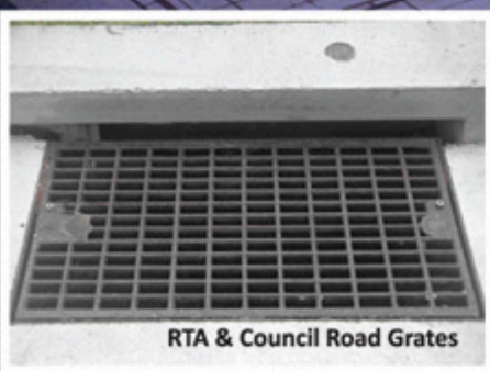
RTA & Council Road Grates